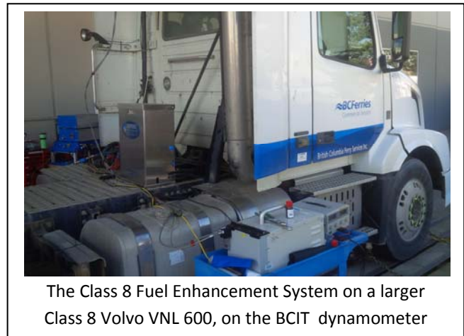
The Class 8 Fuel Enhancement System on a larger Class 8 Volvo VNL 600, on the BCIT dynamometer