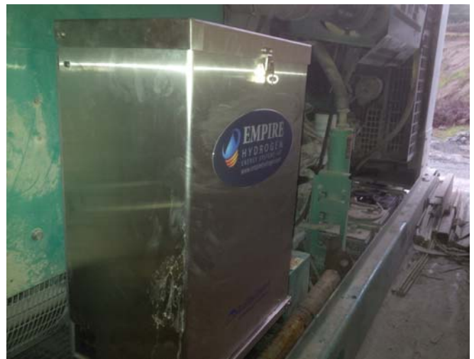
Empire Hydrogen on a Butler Concrete Generator

November 25, 2020: Saanichton, BC: Empire Hydrogen is pleased to announce the installation of a third evaluation unit at Butler Concrete in Saanichton, on Vancouver Island. Empire's Fuel Enhancement System was installed on the large, enclosed generator used for Butler's rock crushing operation. It will run for long hours every day to keep up with their ever increasing demand for concrete and aggregate products. Butler Concrete has made public their ambition to become the greenest concrete company in North America and Empire Hydrogen will move them well along towards this goal. They have more than 50 trucks in operation and are looking at Empire Hydrogen as an important component of their plans.