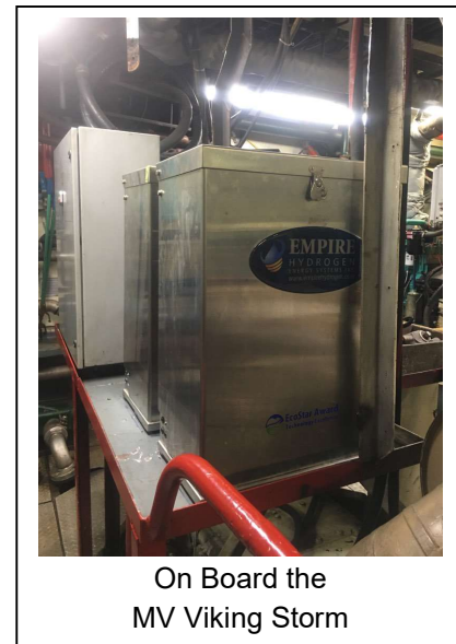
On Board the MV Viking Storm

These installations are subsidized by the Canadian Federal Government, Department of Fisheries and Oceans, " Fisheries and Aquaculture Clean Technology Adoption Program " (FACTAP) that provides a 75% rebate on green technologies. This program paves the way for a new market for Empire Hydrogen and we will be establishing a program specifically to target the fishing and aquaculture industries.