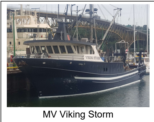
MV Viking Storm

January 24, 2022: Sidney, BC: Empire Hydrogen is pleased to announce our first installations on a major fishing fleet. Pacific Seafood has installed the Empire Hydrogen Fuel Enhancement System on two of its fleet; the MV My Lady Jane and the MV Viking Storm.